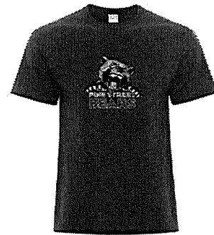
ADULT COTTON T-SHIRT