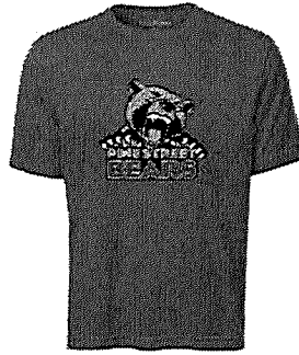
MENS ACTIVE T-SHIRT