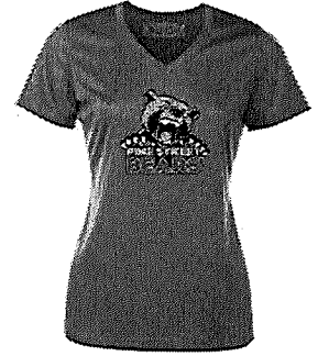
LADIES ACTIVE V-NECK T-SHIRT