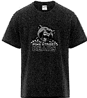
YOUTH COTTON T-SHIRT