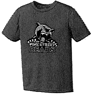
YOUTH ACTIVE T-SHIRT