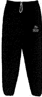
YOUTH SWEAT PANT