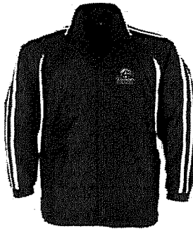
YOUTH TRACK JACKET