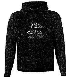
ADULT PULLOVER HOODIE