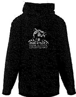
YOUTH PULLOVER HOODIE