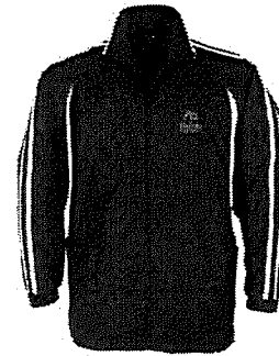
ADULT TRACK JACKET