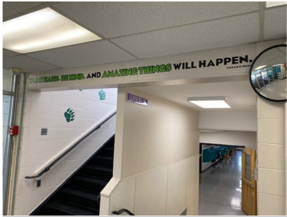
21-05-11 Pine Street 21-05-11 PNE Council Minutes Page 8