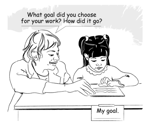
Teachers talk to students about class work every day.

How well are students doing? Teachers assess student work in many ways.